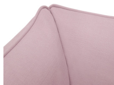
Washable and replaceable covers