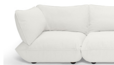
Easily to assemble