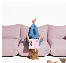
Firm seating comfort