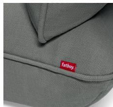
FibreGuard stain resistant technology